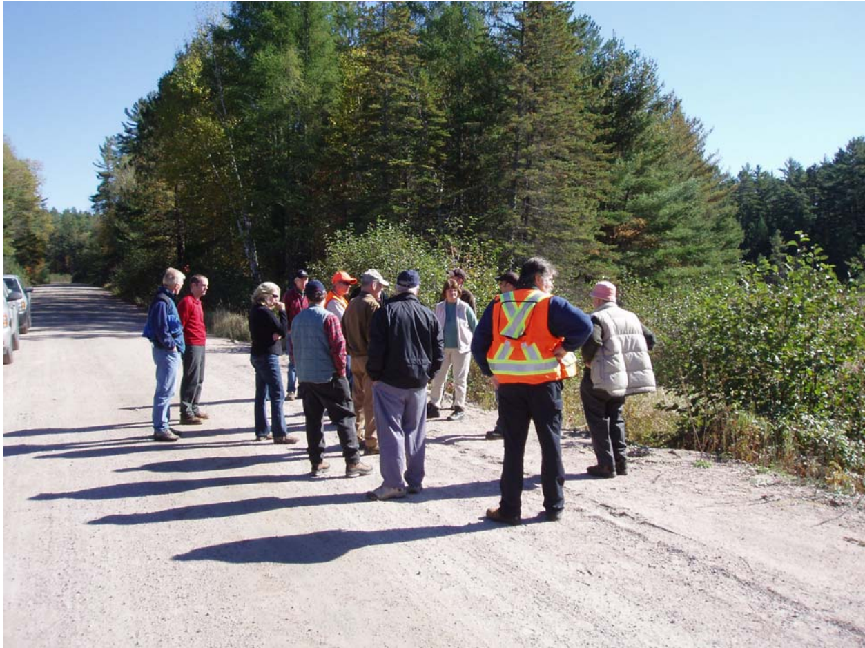
Figure 4: Algonquin Park Local Citizens Committee Discussing Species at Risk Protection