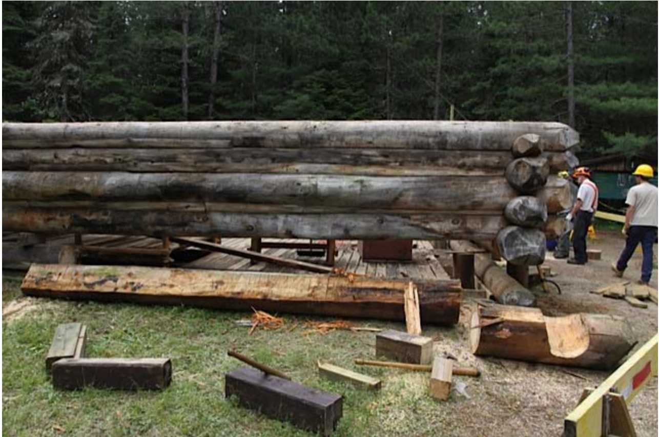
Figure 1: Repairs to the Algonquin Park Logging Museum Camboose Camp