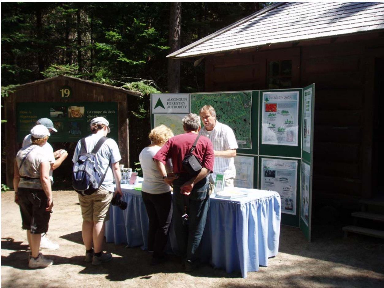
Figure 3: AFA Booth at Logger's Day 2011

There were seven recipients of the AFA funded Forest Industry Scholarship in 2010 ($3,500 awarded) to students attending secondary schools in communities around Algonquin Park.